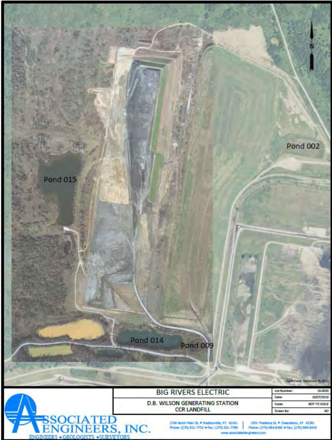
Attachment A - Aerial Photo of the D.B. Wilson CCR Landfill