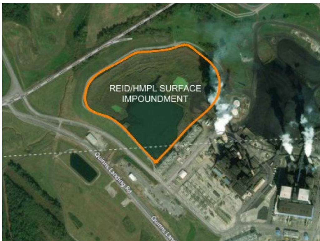
Figure 1: Big Rivers Reid/HMPL CCR Surface Impoundment Overview

The CCR unit has been in existence for more than 40 years. The CCR unit operator has general maintenance and repair procedures in place as they determine necessity. There are no known occurrences of structural instability of the CCR unit. The current Reid/HMPL CCR Surface Impoundment footprint is approximately 25.4 acres. An aerial photograph of Reid/HMPL CCR Surface Impoundment is shown below in Figure 1.