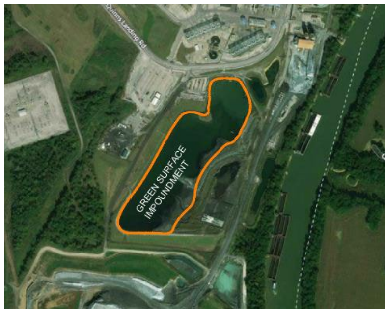
Figure 1: Green CCR Surface Impoundment Aerial Photograph

The CCR unit has been in existence for more than 40 years. The CCR unit operator has general maintenance and repair procedures in place as they determine necessity. There are no known occurrences of structural instability of the CCR unit. The current Green CCR Surface Impoundment footprint is approximately 21 acres. An aerial photograph of Green CCR Surface Impoundment is shown below in Figure 1 .