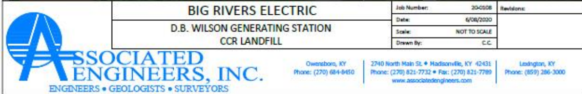
Attachment A - Aerial Photo of the D.B. Wilson CCR Landfill